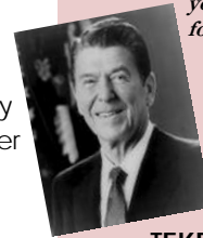
Ronald Regan Iota Chapter Eureka College, 1929

"Membership in Tau Kappa Epsilon is a privilege and an opportunity that will be valuable throughout your college years and for all the years to follow"